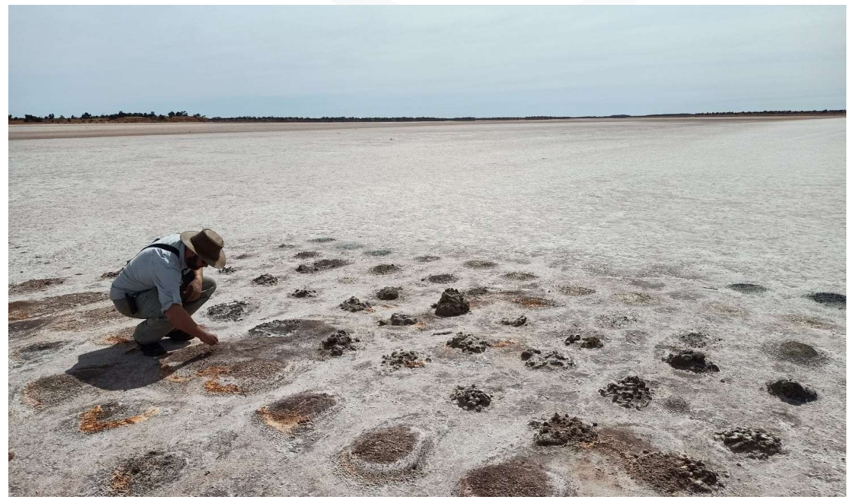
Figure 1: 17 November 2020 Inspecting aircore chips from 2019 Queen Lapage drilling.

Mr Bellandi commented: "I am very enthusiastic to join the Riversgold team. The Company has an impressive tenement package with tremendous potential for large discoveries. The existing geochemical anomalies under Lake Yindarlgooda show potential for substantial mineralisation and I am looking forward to working with Quarterback and Riversgold and contribute to the discovery of the next generation of gold deposits in the Eastern Goldfields of Western Australia. We will be very busy in the next three months planning for drilling activities and generating more targets through geophysics and geochemistry surveys."