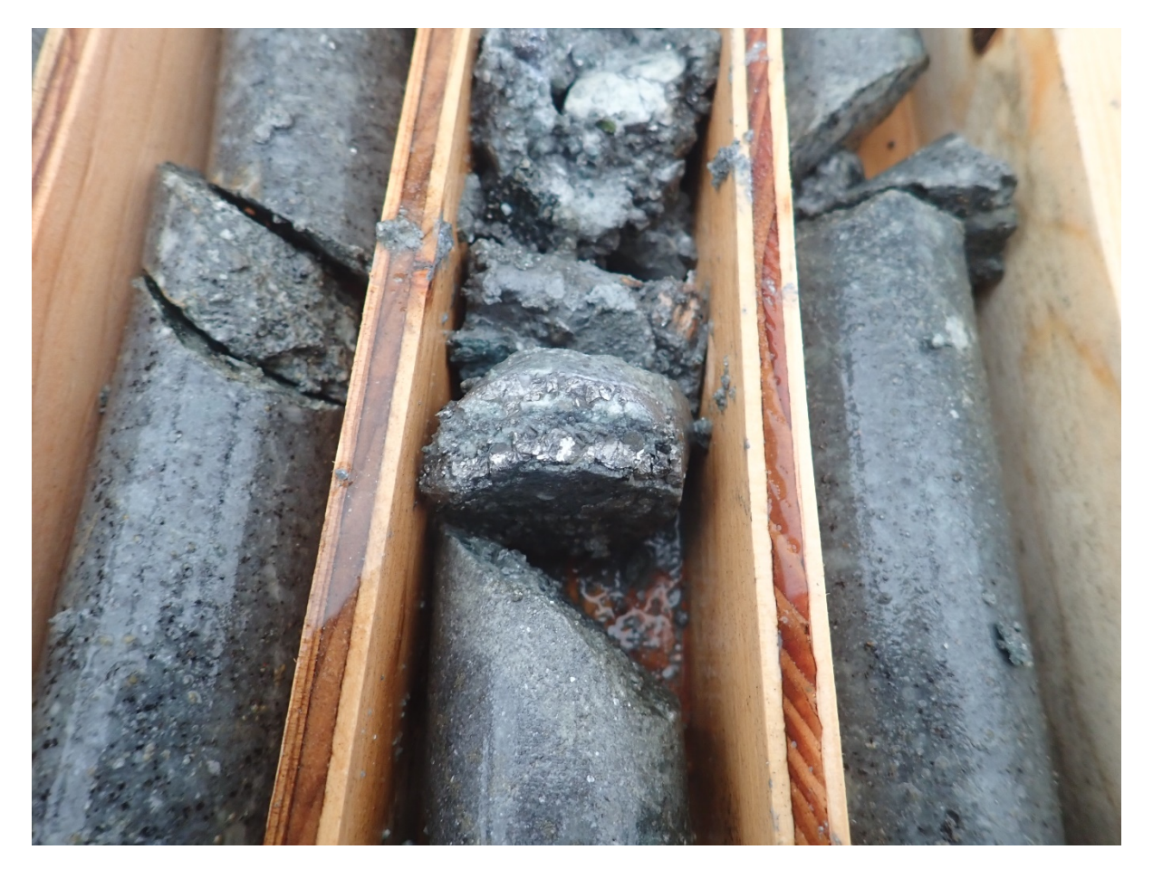
Figure 3. Massive arsenopyrite vein surrounded by disseminated sulphides (63.72m).