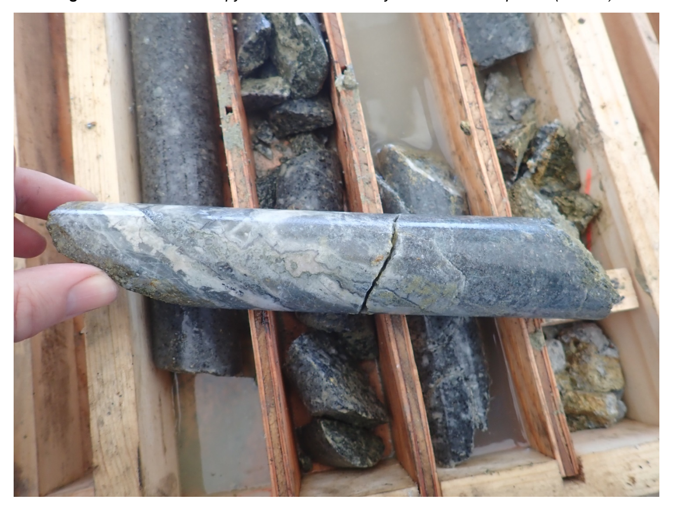
Figure 4. Colloform banded quartz vein with disseminated arsenopyrite mineralisation (79.27m).