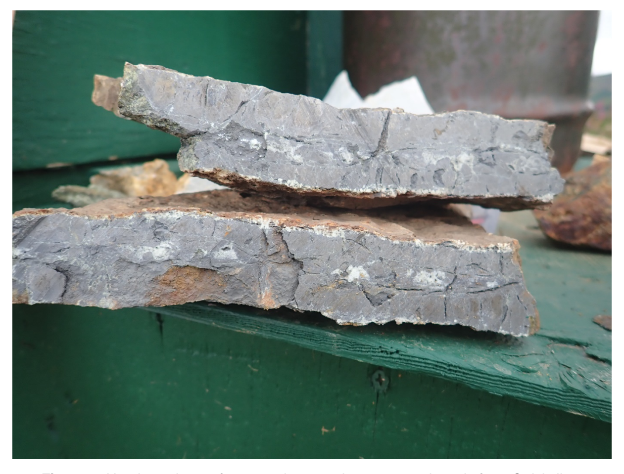
Figure 2. Hand specimen of outcropping massive arsenopyrite vein from Quicksilver.