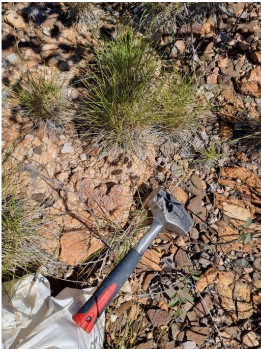
Photo 1: New Pegmatite #5 at Bengal, located 85m from historical gold mine, “Logans Find”

Riversgold Limited (ASX: RGL, “Riversgold” or the “Company”) is pleased to report rapid progress at the Company’s 100% owned Tambourah Lithium Project, with the completion an extensive geochemical sampling program and a deep ground penetrating radar (“DGPR”) orientation field program. The DGPR program is designed to identify the depth and strike extent of pegmatite systems. pXRF analysis and DGPR results are currently being processed and evaluated with results expected in mid-August 2022.